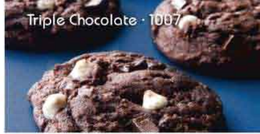
Triple Chocolate · 1007