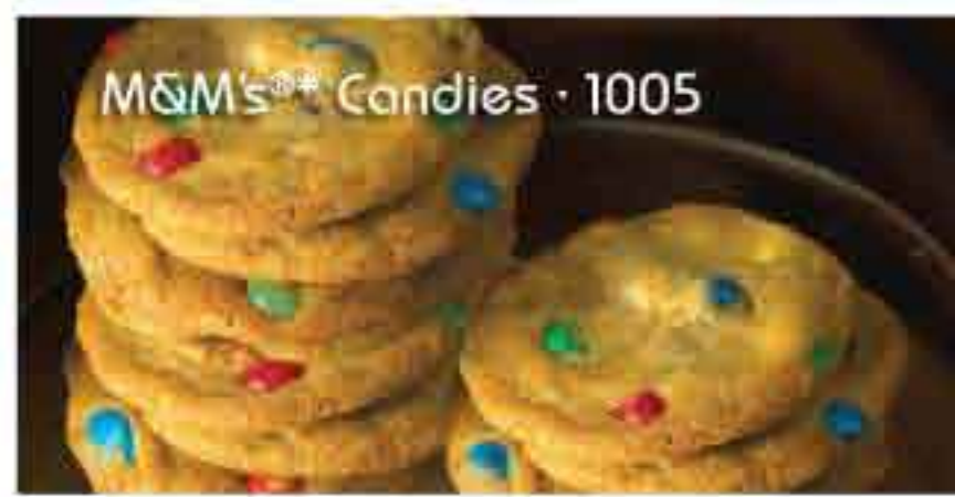
M&M's® Candies · 1005