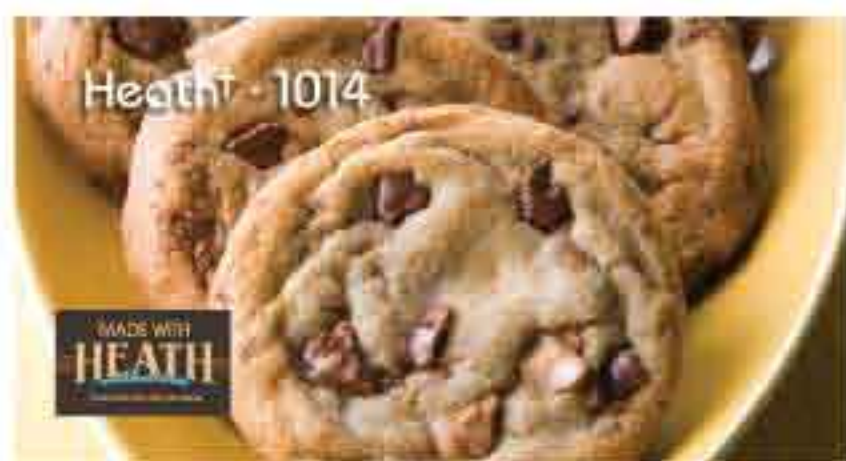
Heath® · 1014