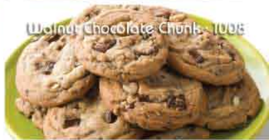
Walnut Chocolate Chunk · 1008