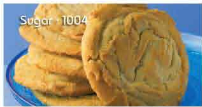
Sugar · 1004