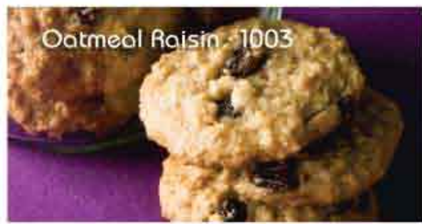
Oatmeal Raisin · 1003