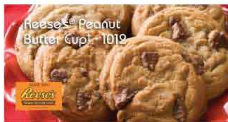
Reese's® Peanut Butter Cup® · 1012