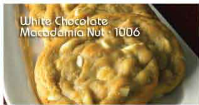
White Chocolate Macadamia Nut · 1006