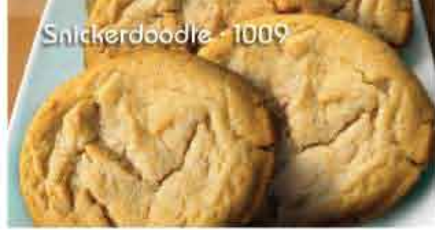
Snickerdoodle · 1009

Cookie dough comes in a decorative resealable tub that yields approximately 48 cookies!