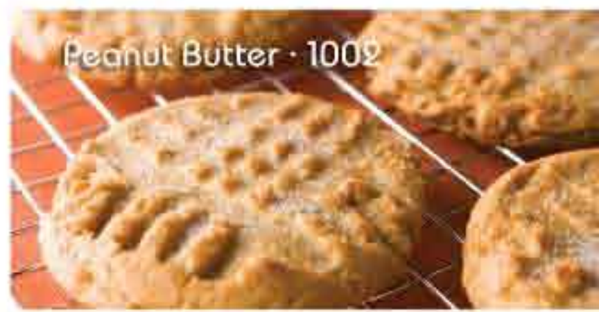
Peanut Butter · 1002